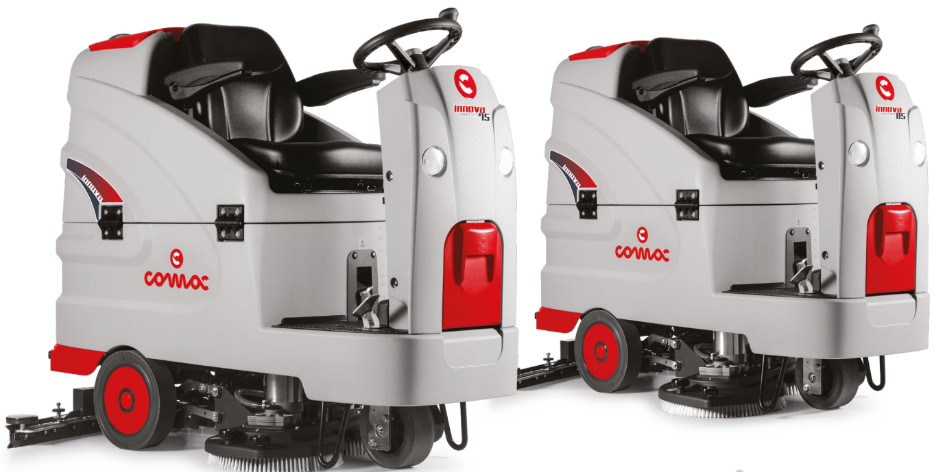
INNOVA COMFORT 75 B Scrubbing version with dual disc brush Working width: 750 mm