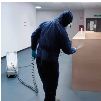
Disinfection Hospitals ambients