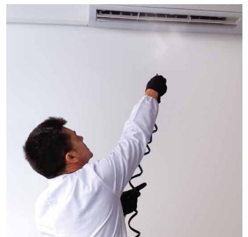
Sanitization Air conditioners and air conditioning ducts