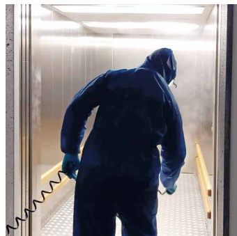
Sanitization High traffic areas