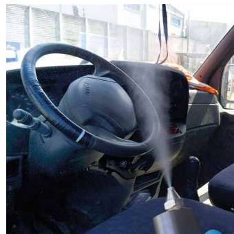
Deodorisation Car interiors