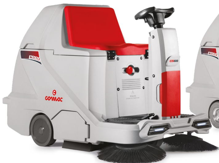
CS60 B Battery version