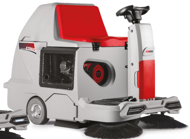
CS60 Hybrid Battery and internal combustion engine version