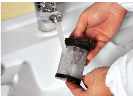
Vispa 35 E-B-BS Simple and practical thorough cleaning of the suction filter