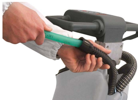
Vispa 35 B-BS Periodic cleaning of the squeegee hose to ensure efficient suction