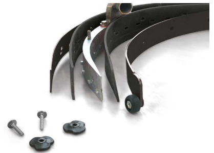
Vispa 35 E-B-BS In order to ensure excellent drying performance, the squeegee rubbers should be kept always clean. When worn out, they are very easy to replace