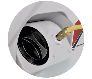
FFS - FAST FILLING SYSTEM A simple device allows the quick filling of the tank with clean water without the presence of the operator

Innova is available on request with a support for your manual cleaning kit, that allows to complete the cleaning operation