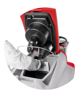
SILENCED VACUUM HEAD AND COMPLETE TANK SANITIZING It allows to perform in highly noise-sensitive environments.